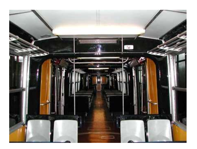
Maintenance of railway carriages

A project design, assembly and interior furnishings maintenance, imperial and driver cabins painting, ETR n° 51 Circumvesuviana.