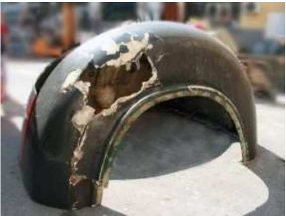
Reparation of ETR 500 parts, Freccia Rossa.