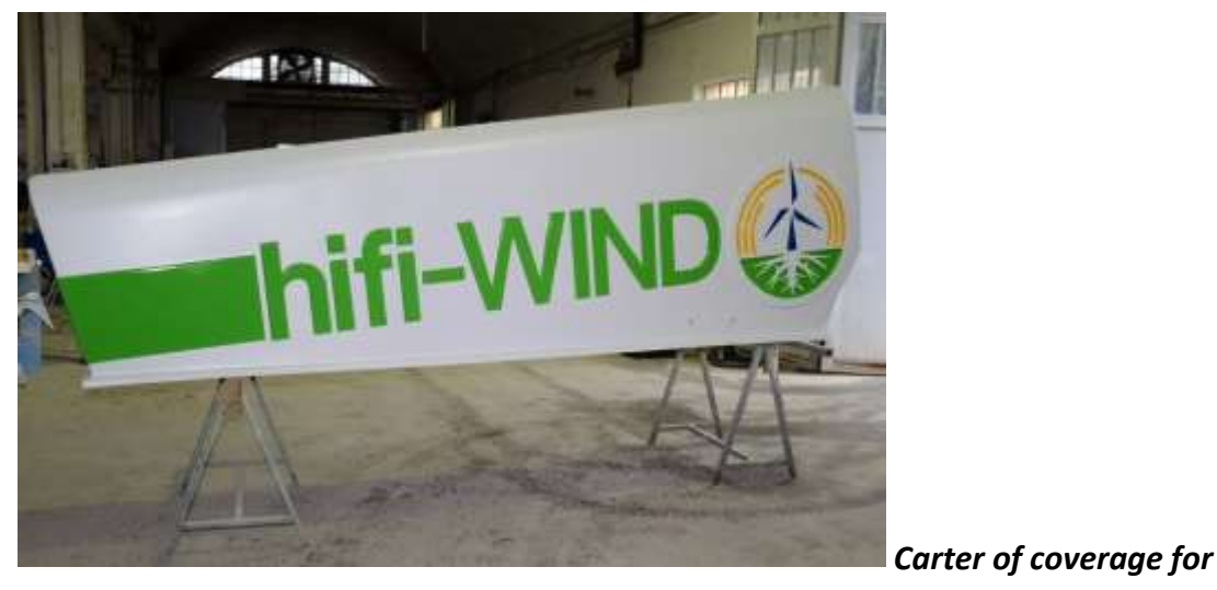
alternator of eolic tower.

Tecnocompositi - Via F. Budi 71 84018 Scafati (SA) - Tel. 081 8509603 - Fax081 8509892 - Info@tecnocompositi.com - www.tecnocompositi.com