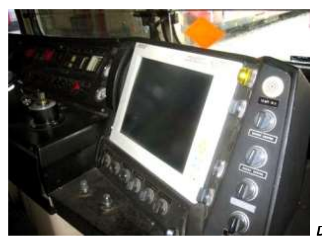
Dashboard control desk

A project design, assembly and interior furnishings maintenance, imperial and driver cabins painting, ETR n° 51 Circumvesuviana.